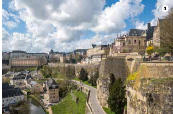
1 Citadel on Saint-Esprit Plateau 2 Petrusse park 3 Upper town park 4 Corniche ramparts

LE GOUVERNEMENT DU GRAND-DUCHÉ DE LUXEMBOURG Ministère de la Culture